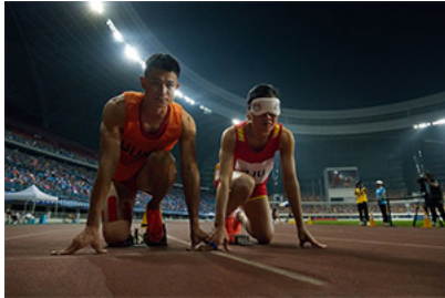
Feel safe, be free