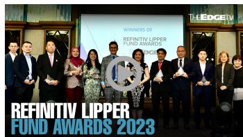
27 Mar 2023 | 07:00am Featured, News NEWS: Public Mutual and Manulife biggest winners of Refinitiv Lipper Fund...