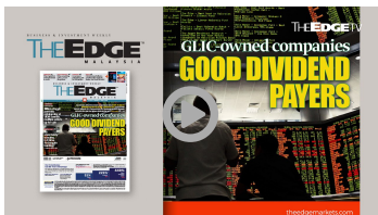
27 Mar 2023 | 03:28pm Behind the Stor... EDGE WEEKLY: GLIC-owned companies good dividend payers